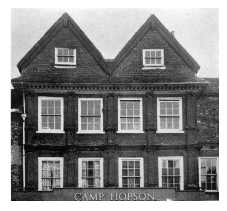
FIRST KNOWN MEETING ROOM (Upper Storey)

to the minutes of meetings was a customary procedure at this period, while persons who could not write placed their cross.